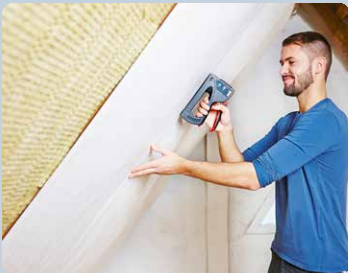
Fastening down sheeting in a loft.