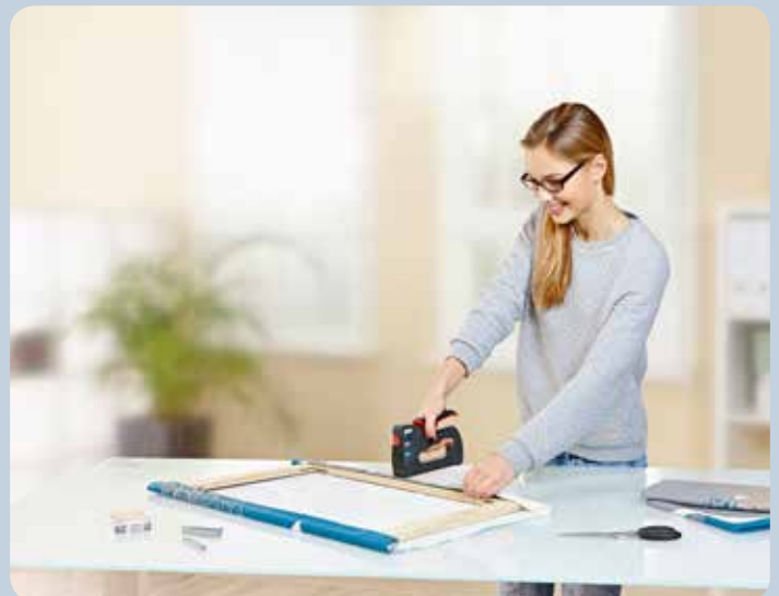
Quickly covered picture frame.