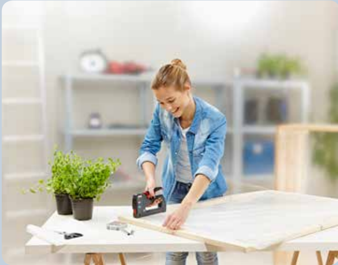
Easy attachment of sheeting.