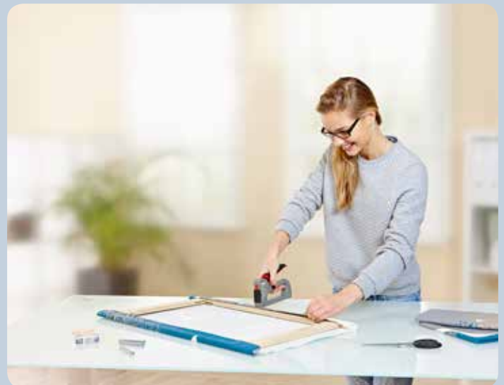
Quickly covered picture frame.