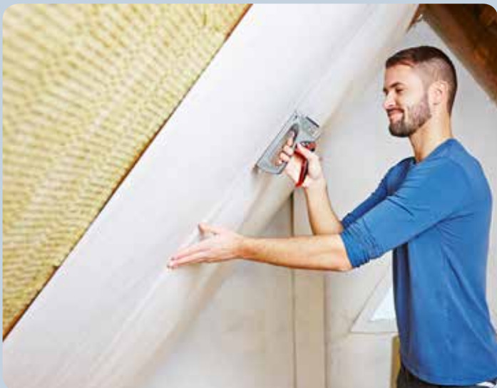
Fastening down sheeting in a loft.