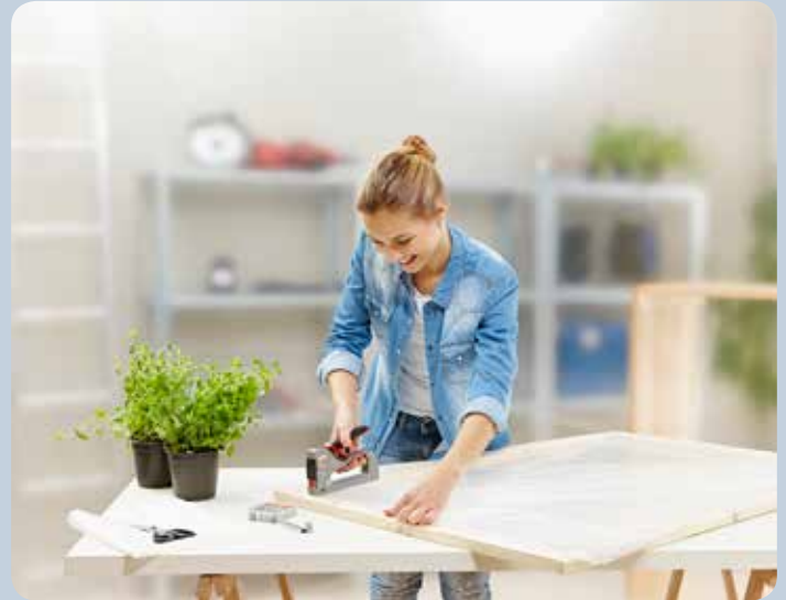
Easy attachment of sheeting.