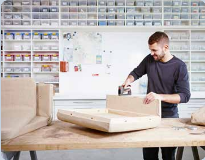
Threadbare upholstered seats can be spruced up again simply by tacking on new fabric.