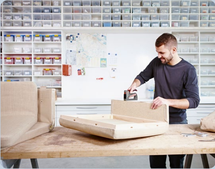
Threadbare upholstered seats can be spruced up again simply by tacking on new fabric.