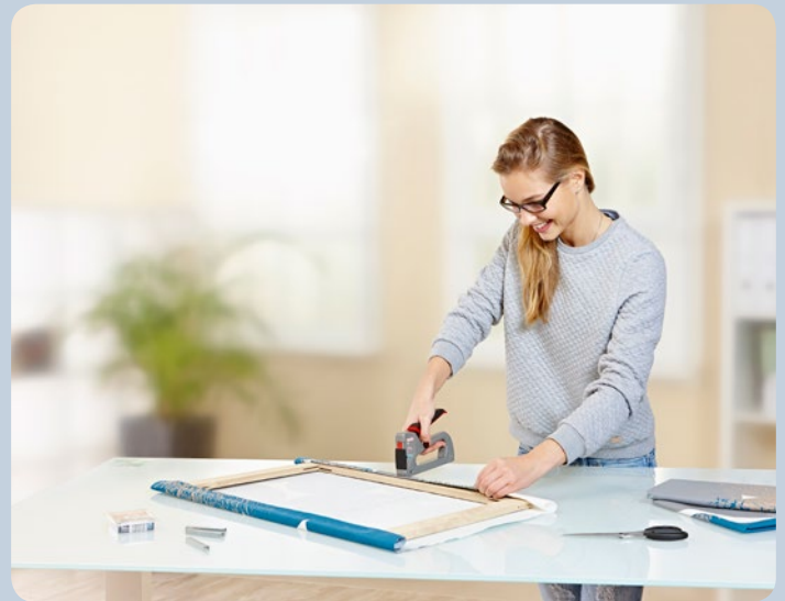
Quickly covered picture frame.