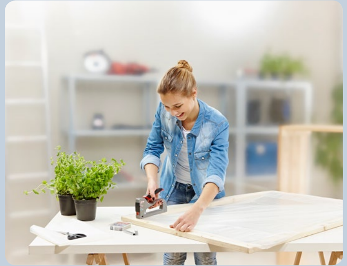
Easy attachment of sheeting.