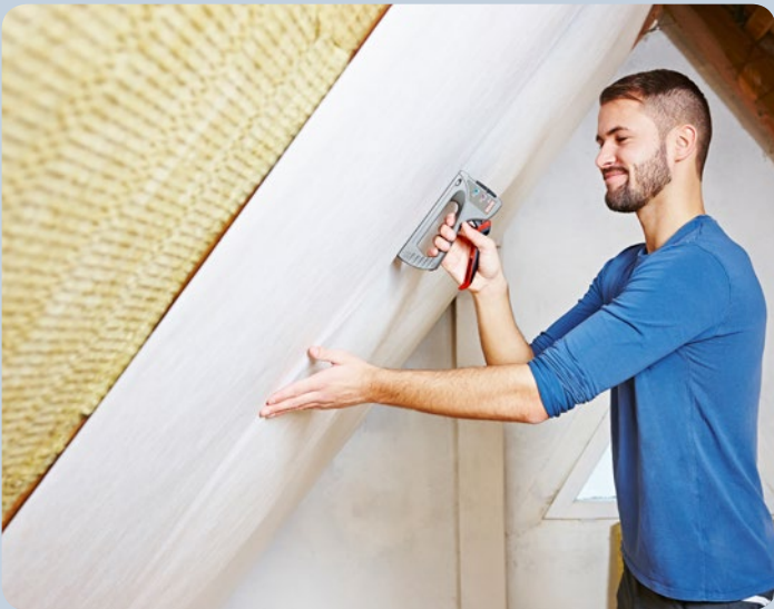
Fastening down sheeting in a loft.