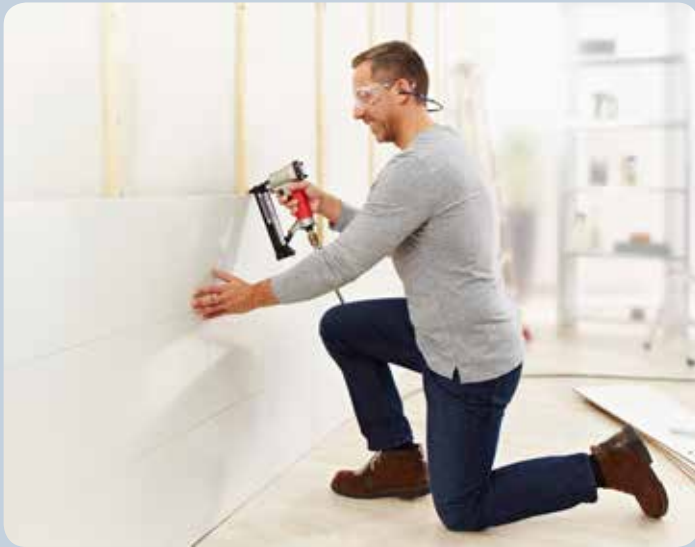
Fastening of tongue-and groove boards with clips.