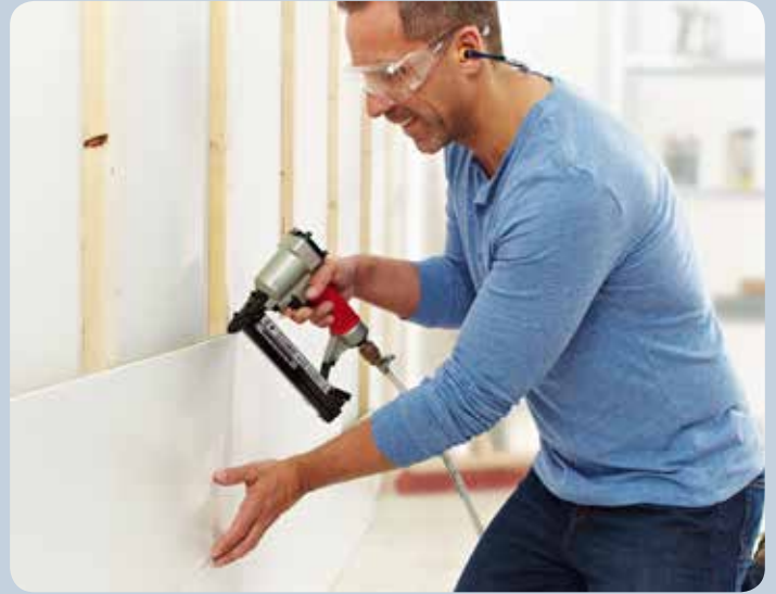
Panelling without clip, attached directly.