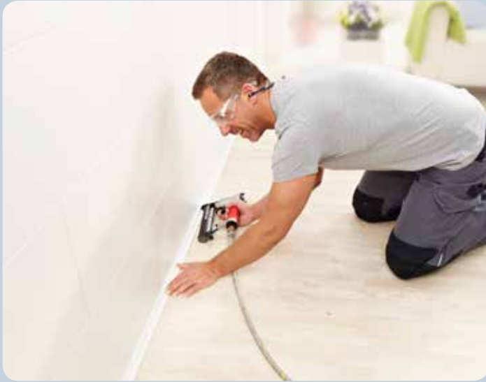
Easy nailing of decorative moulding.