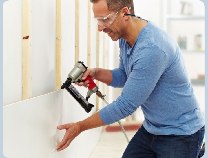
Panelling without clip, attached directly.