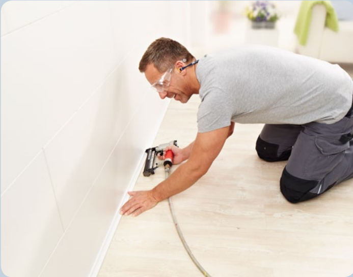
Easy nailing of decorative moulding.