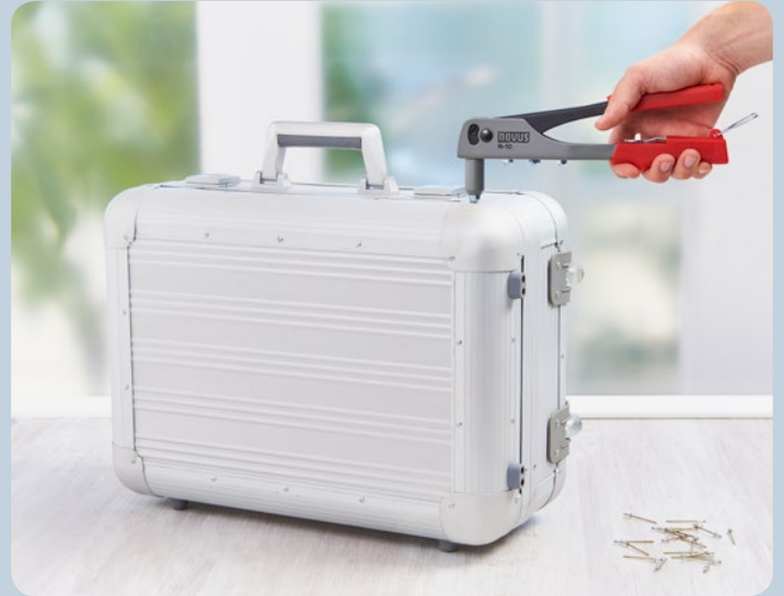
Riveting can be even used for reliably repairing firm materials, like aluminium.