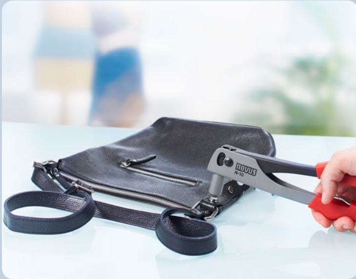
Easy fixing of carry handles.