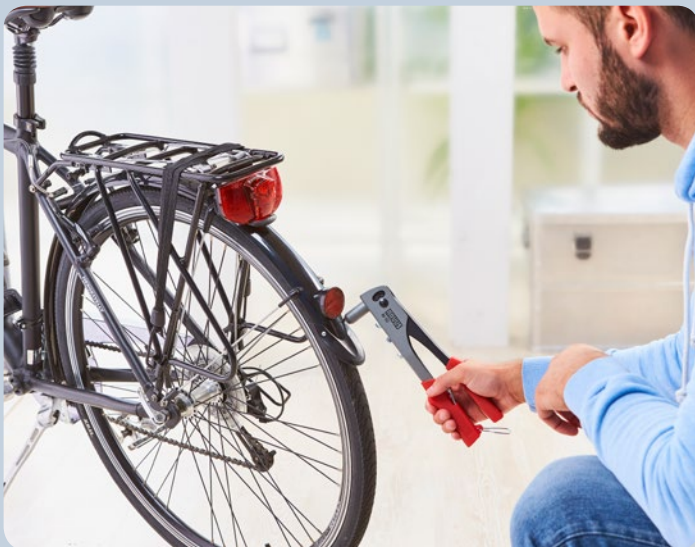
Fastening of protection plates