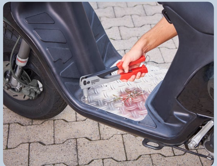
Riveting can be even used for reliably repairing firm materials, like aluminium.