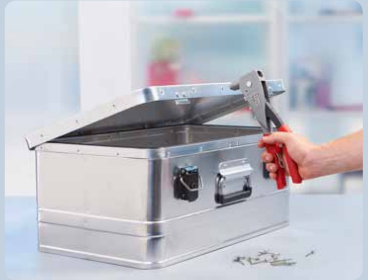
Riveting can be even used for reliably repairing firm materials, like aluminium.