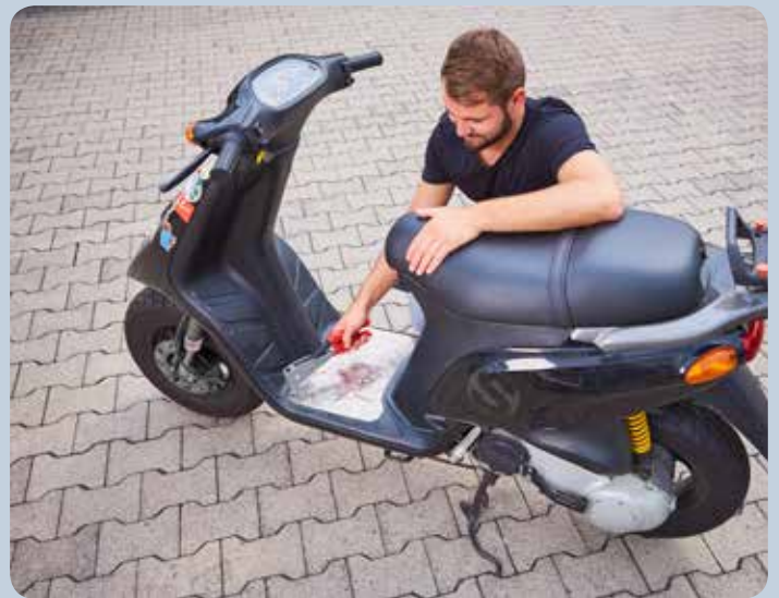
Riveting can be even used for reliably repairing firm materials, like aluminium.