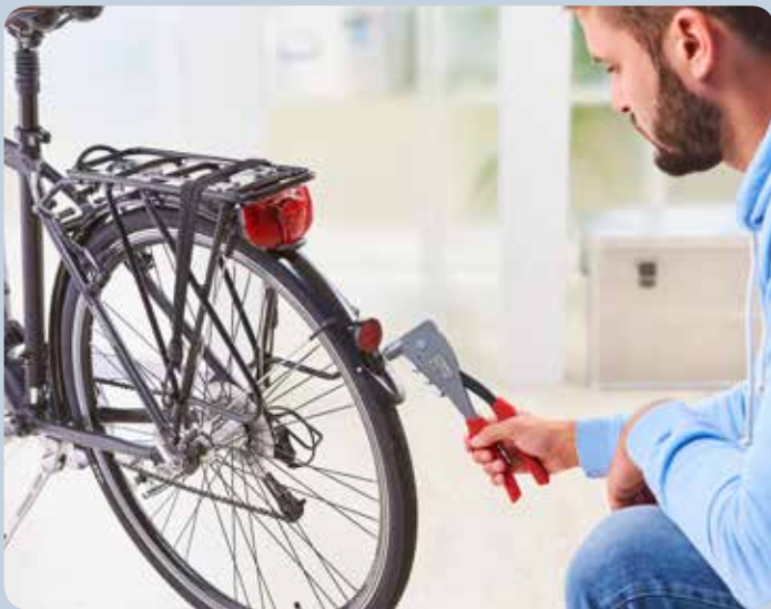
Fastening of protection plates