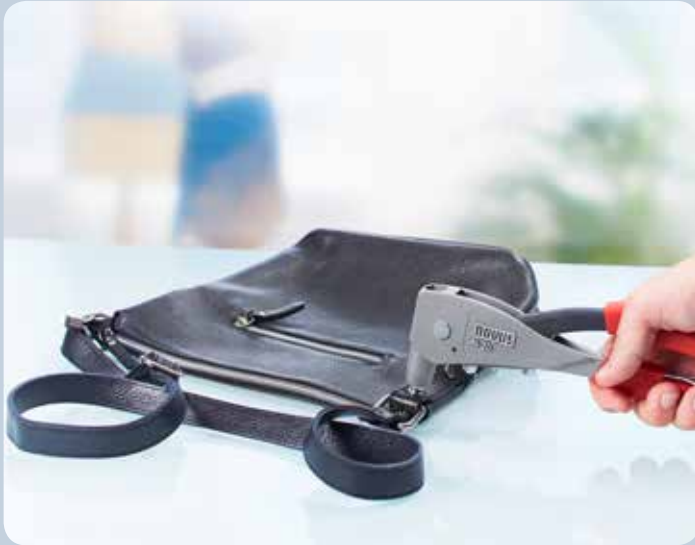
Easy fixing of carry handles.