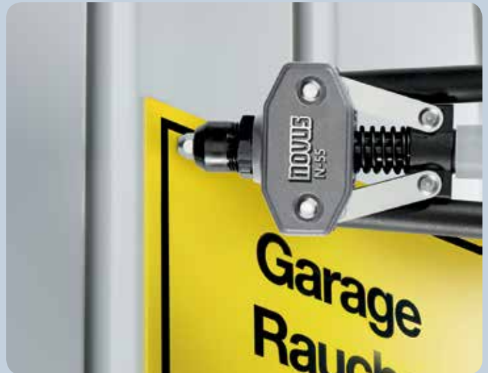
Signs can be securely attached to a wide range of different surfaces.