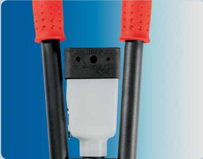
Everyday companions like handbags, are quickly repaired.