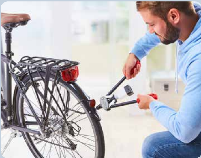
Fastening of protection plates