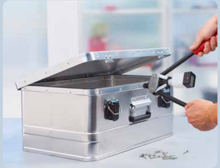
Riveting can be even used for reliably repairing firm materials, like aluminium.