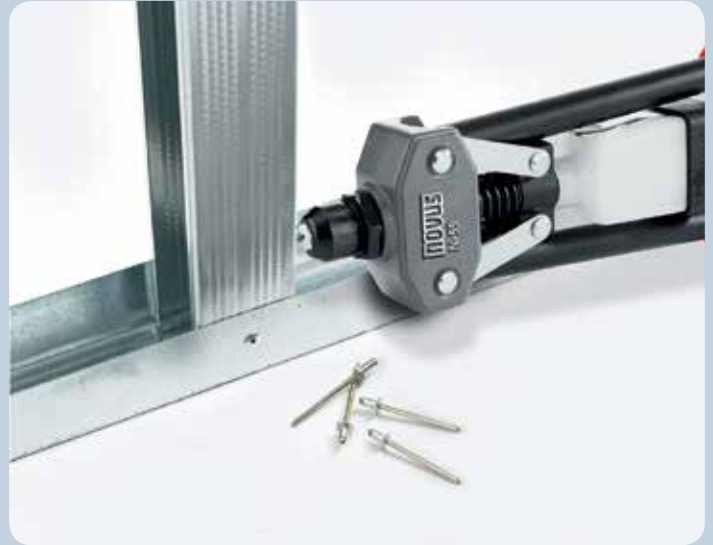
Riveting can be even used for reliably repairing firm materials, like aluminium.