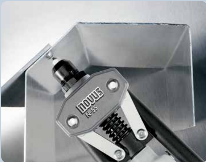
Ideal for fastening of sheet steel.