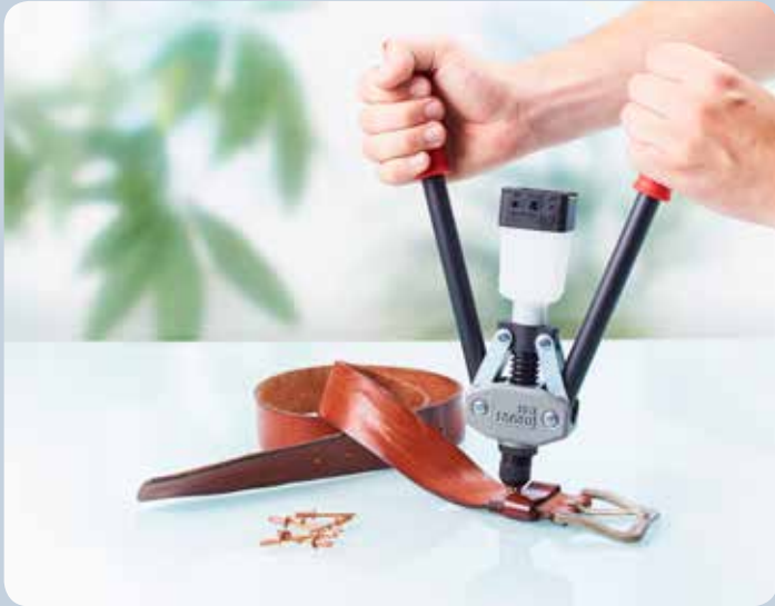
Everyday companions like handbags, are quickly repaired.