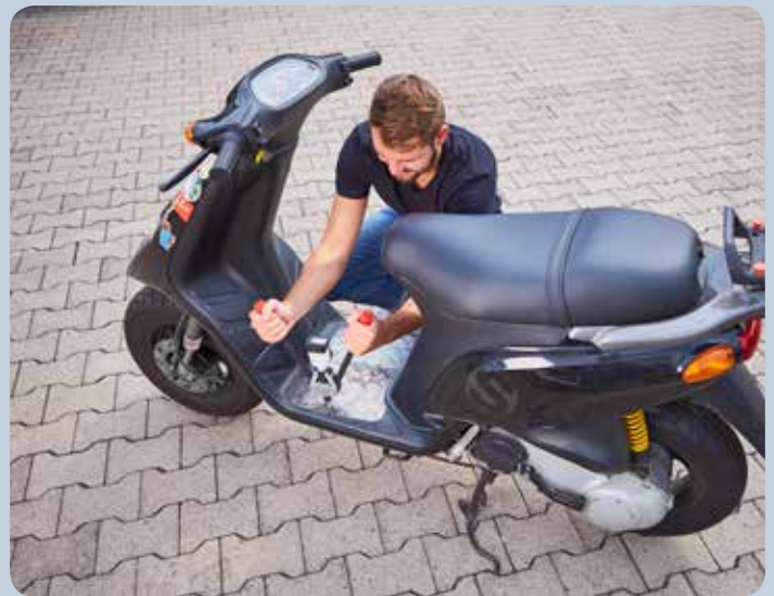
Riveting can be even used for reliably repairing firm materials, like aluminium.